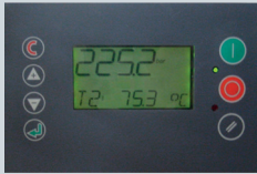
Advanced electronic control system