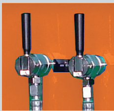
Lever operated on/off valves with auto exhaust system